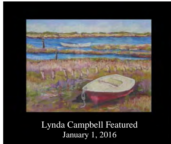
Lynda Campbell Featured January 1, 2016

Trail's End Art Association 656 A Street, PO Box 2351 Gearhart, Or 97138 503-717-9458