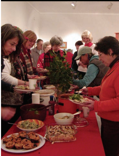
December 10th Potluck