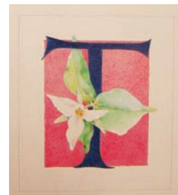
T is for Trillium Judith Fredrikson

Cost: $15 per session for members; $18 per session for non-members This beginning drawing class will start with a four-session segment. Students will study value and shadow to create illusion of three-dimension, try different drawing tools, learn ways to create texture, and explore interplay of basic shapes and details. Classes will include time to try quick sketching and contour drawing styles. Call Judy Fredrikson (503-791-0759) to sign up. If you want a kit of basic materials for a one-time cost of $15, let Judy know when you sign up.