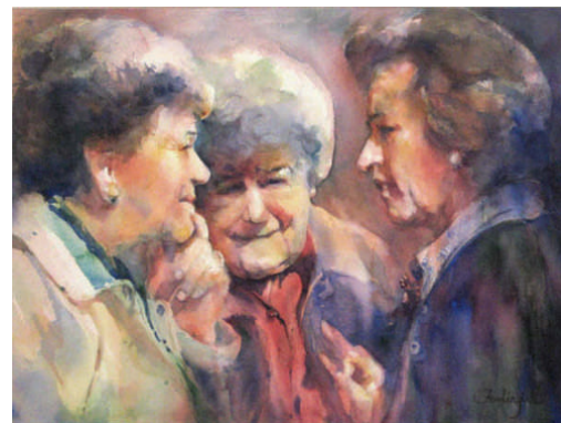
Fealing Lin Transparent Watercolors