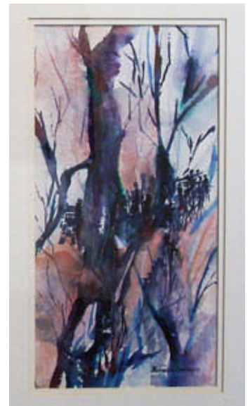
Featured Art-Surrealism See more on the artist inside

Nov/Dec Small Works - Affordable art For Holiday Gifts