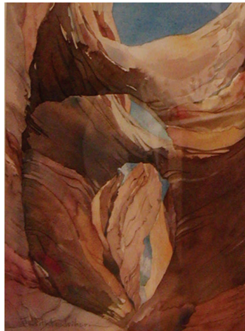
Mother Earth in Sandstone - First in Watercolor, Judith Fredrikson