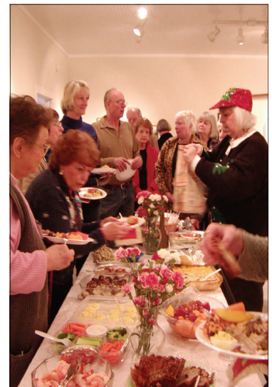
Holiday Potluck. There really isn't anything quite like a TEAA luncheon!