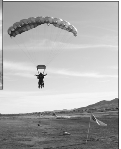
Sheila on her recent vacation (some of us sit on beaches) Participants at the General Meeting were treated to the full video of the jump.