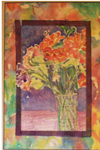
Featured Art Work

She is also a member of the Palette Puddlers , which is a painting group that meets weekly in Cannon Beach. The group shows their art three to four times a year.