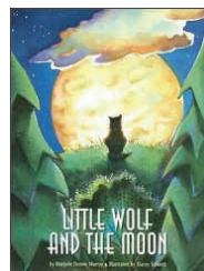
Example of a well written children's book.