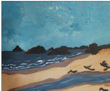
September's Featured Work