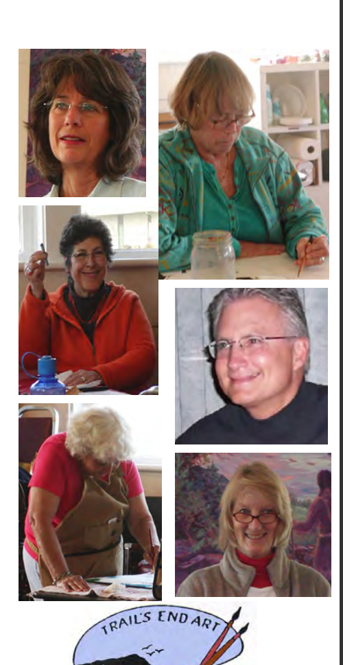
The oldest art organization of its kind on the coast of Oregon...